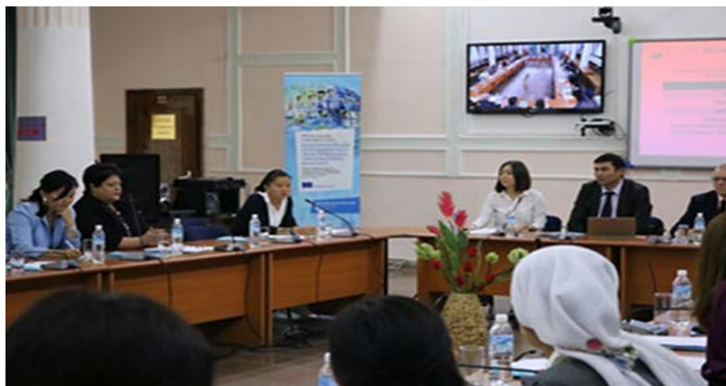
HERE Seminar "Development of entrepreneurial skills - New challenges to universities", Bishkek, 20/09/2018

Finally, HEREs contributed to the development of the new Education Development Strategy 2030, by participating in working groups of the Ministry of Education and Science. HEREs were responsible for the development of the section on higher education.