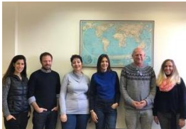
Members of Israeli HERE team

During 2018, a committee of experts discussed the current condition of English studies as a foreign language in the Israeli higher education. Recommendations were submitted to the CHE and policy is under development.