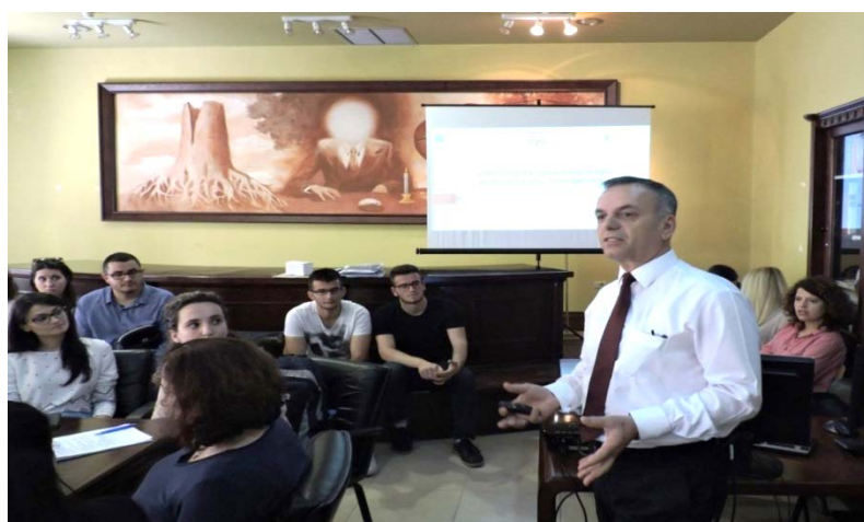
HERE Seminar on “Enhancing student’s role in HEIs governance and management” Polytechnic University of Tirana, 24/05/2018

- HERE section of NEO website http://erasmusplus.al/?page_id=593 - List of HEREs on NEO website http://erasmusplus.al/wp-content/uploads/2017/06/Albanian-HERE-Team.pdf - HERE publications or articles http://erasmusplus.al/?page_id=1034 - HERE event pages http://erasmusplus.al/?page_id=1034 - HERE Facebook page https://www.facebook.com/Albanian-HERE-for-Erasmus--1815269242080077/ -Media TV programme links https://www.youtube.com/watch?v=WZ0PiF6vh1U&list=PL0XoaVRW0j7DAI77X9eedCHNXbambIRP0&index=34&t=0s | https://www.youtube.com/watch?v=QzGwIBj9ygk | https://www.youtube.com/watch?v=HVRfsskjgFA&list=PL0XoaVRW0j7DAI77X9eedCHNXbambIRP0&index=36&t=0s