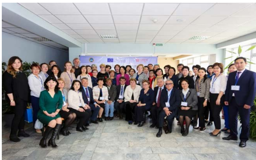
HEREs of Kazakhstan and Kyrgyzstan at the Regional TAM Seminar “European Best Practices on Major-Minor Educational Programme Development” - Almaty, 13-14/04/2018

In order to reach a wide audience all over the country, HEREs organised two webinars with the technical support of NEO on topics of internalization and inclusion. Moreover, HEREs came up with the idea to record video lectures as follow-up to the international HERE training events and upload them online. Two such lectures were recorded, featuring the Study Visits to London and Coimbra.