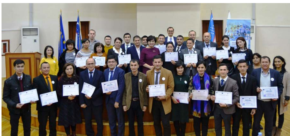
The 2 nd conference “Erasmus+ International Credit Mobility: Role in Improving Quality of Education and Research”, Tashkent Financial Institute, 4/12/2018

3. Round table meeting of HEREs on the Bologna process with the representatives of the Inspection for Supervision of Quality in Education under the Cabinet of Ministers of Republic of Uzbekistan took place on 6 November 2018. Heads of Inspection departments, two representatives of TUIT (Vice-Rector and university teacher), four HEREs and one NEO representative participated in the meeting. The presentation of TUIT Vice-Rector about their experience of ECTS introduction was followed by a lively discussion with many questions. The meeting was appreciated by all participants and in particular by the Inspection staff, who had been working on new Law on Education.