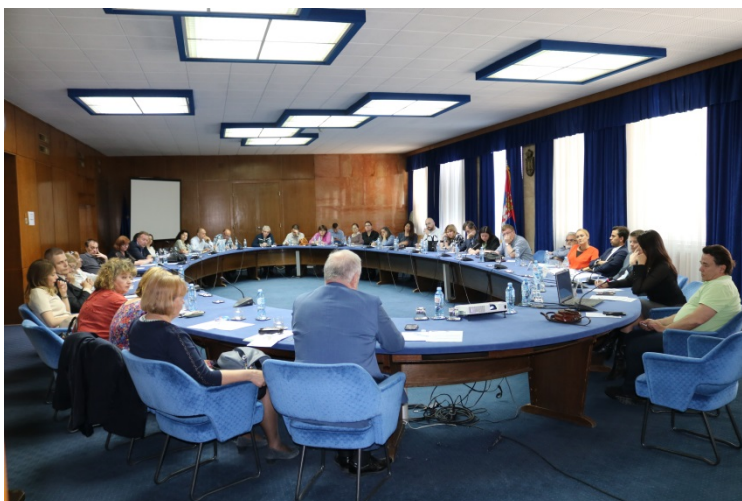
Round table “Challenges in Higher Education, Recognition of Prior Learning and Distribution of ECTS” Palace of Serbia, Belgrade, 25/04/2018

In April 2018, HEREs organised a round table discussion to address the recognition of prior learning and ECTS allocation. The event was attended by 40 representatives of the higher education community in Serbia, including management and teaching staff of state and private HE institutions, as well as representatives of the Serbian Ministry of Education, Science and Technological Development. The European inventory on validation of non-formal and informal learning was presented at the event, as a key pan-European tool, supporting the member states in the process of adopting recognition procedures.