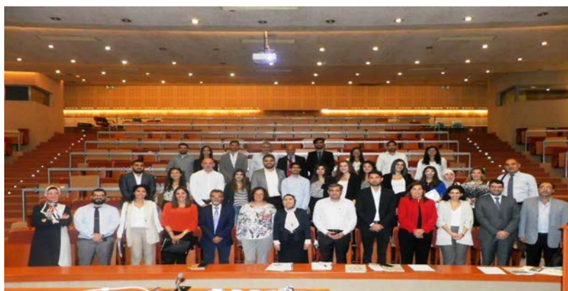
TAM "Roundtable on Students' Participative Role in HE Governance" Beirut, 11/10/2018

The need for a better organisation of research activities and doctoral studies has been acknowledged nationwide. Some progress in this direction has been achieved with the support of UNESCO.