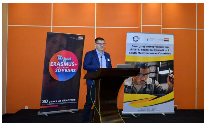
Regional TAM on “Emerging entrepreneurship skills & Technical Education in S.M” Aswan, 1-2/11/2018