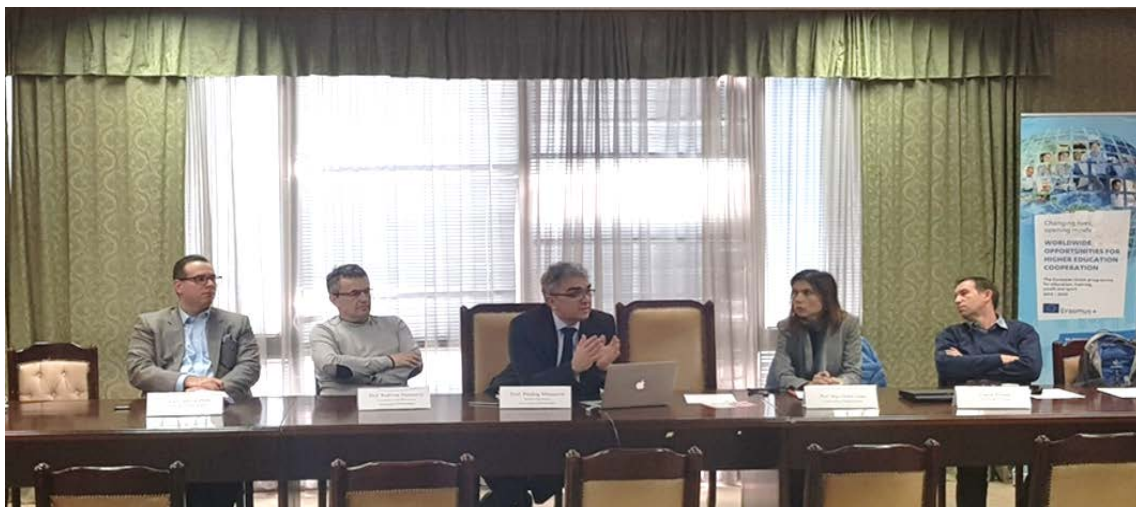
(TAM) “Status of doctoral candidates EEC/WBC vs EU or wider” Podgorica, 19/11/2018

The event “Positioning and Distinguishing of Applied Studies in Montenegrin Higher Education Reforms” generated discussion on the general principles in designing applied programmes in higher education as compared to academic ones. Employability issues were tackled as well.