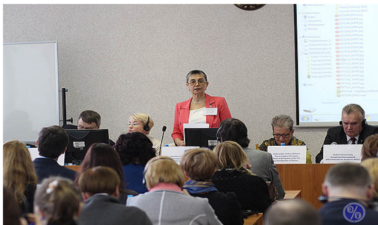
Seminar on 'Quality of higher education in Belarus with the stakeholders' eyes Belarus State Economic University, 21-22/03/2018

The new educational standards of higher education are based on a competence approach and allow implementing the ECTS system as a necessary tool to support student mobility. Transition to the two-level system of training specialists allows to ensure, on the one hand, mass and available education, and on the other hand, its academic and elite nature because education of the highest level can be acquired only by the most well-trained students.