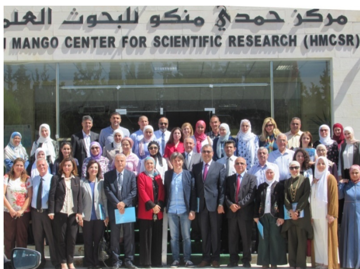
TAM on Research Based Teaching, University of Jordan, Amman, 25/09/2018

1. All HEREs were actively involved in the NEOs' local activities in 2018. For example, all of them participated in the "Cluster meeting with the stakeholders", held at the Dead Sea in September 2018, and all sessions of this meeting were chaired by HEREs. Furthermore, the Aqaba seminar for higher education reform was organised with the active participation of HEREs. The HEREs delivered 7 presentations during the event, addressing various aspects of higher education reform. HEREs were also in full charge of the Technical Assistance Missions (TAMs).