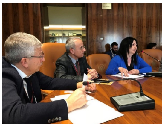
Armenian HEREs at the Annual HERE conference, Rome, 12-13/12/2018

The HERE team, whose composition was enriched by five new members, played an essential role in making gradual impact on developing the higher education system.