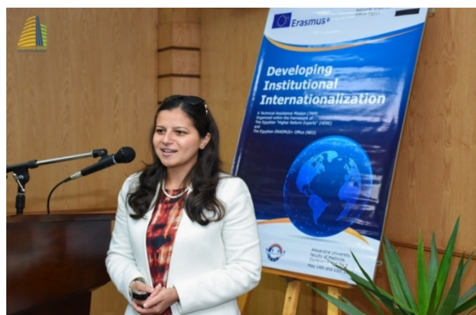
TAM on "Developing Institutional Internationalization" Alexandria University, 14-15/05/2018