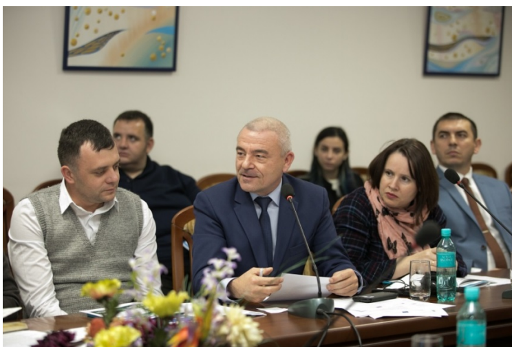
Technical Assistance Mission "International Academic Mobility management improvement – a boost for HEIs Internationalisation", 16/11/2018

1. The constant involvement of the HEREs team members in various committees and working groups in their field of expertise is assuring the quality of their proposals, studies, evaluations and assistance. The seminars organised with the participation of the HERE team members offer a way to disseminate to the wider community the outcomes gained during the HEREs international training events. The HERE team's valuable assistance can be mentioned for example in the context of the organisation of the TAM "International Academic Mobility management improvement - a boost for HEIs Internationalisation".