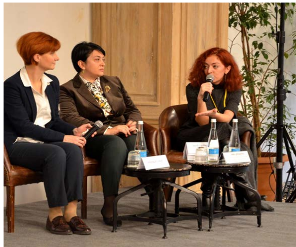
Annual Conference "Introducing revised QA system in HE" Tbilisi, 17-18/12/2018

The higher education funding scheme was also actively discussed during the year. The authorities together with World Bank experts continue to work closely in order to revise the existing voucher model for higher education and to introduce a combined-style funding model (per capita + performance based).