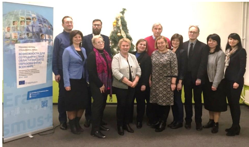
Working meeting of HERE team and NEO, Moscow, 17/12/2018