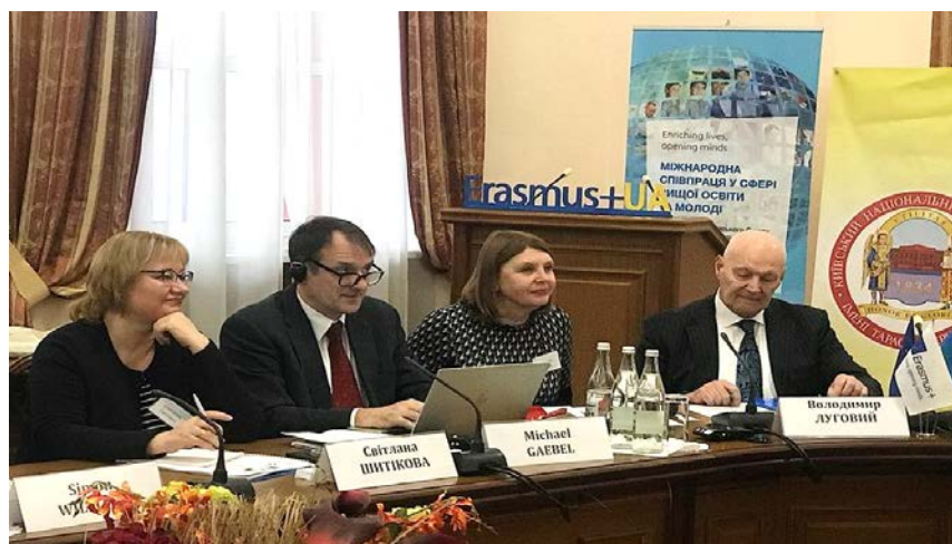
International Bologna process conference - TAM Event "European Integration of Ukraine's higher education" Kyiv, 27/11/2018.

(8) Preparing publications and presentations on higher education reform to clarify key issues for society.