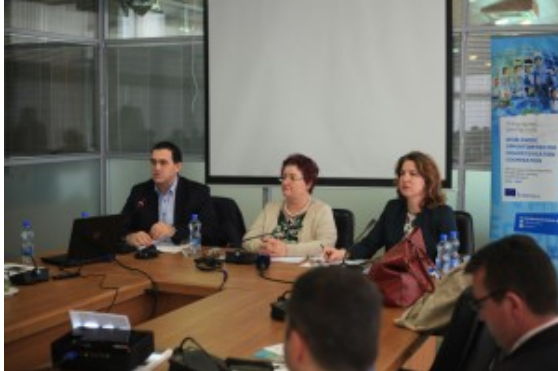
HERE seminar "Students as main stakeholders in HE development and reform", 24 March 2016, Ministry of Education, Science and Technology

different initiatives for the professional development of the academic staff.