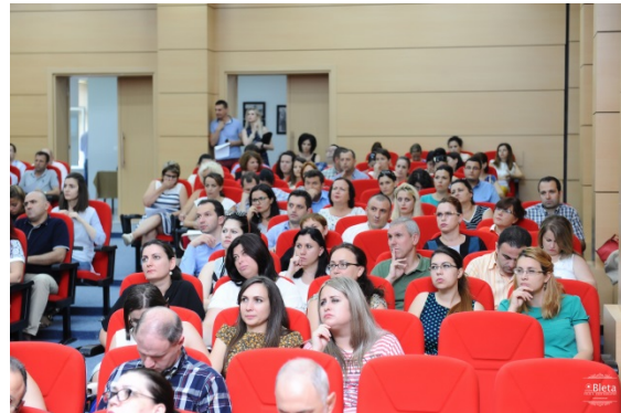
Seminar "Innovation and information technology as a means for improving and developing teaching methods", 8 July 2016, University "Ismael Qemali, Vlora"

3. Recommendations' paper aiming at influencing the drafting of the future bylaws. This paper was presented by the Albanian HEREs' team to the national authorities after the seminar on the theme ‘Innovation and information technology as a mean for improving and developing teaching methods’ at the University of Vlora on July 2016. The main result of the seminar was to recognize the benefits of using innovative methods and ICT for enhancing the quality of teaching and learning. This would help in moving towards a student-centred learning model and pave the way to policy changes and new bylaws in accordance with the best practices currently in use in European universities.