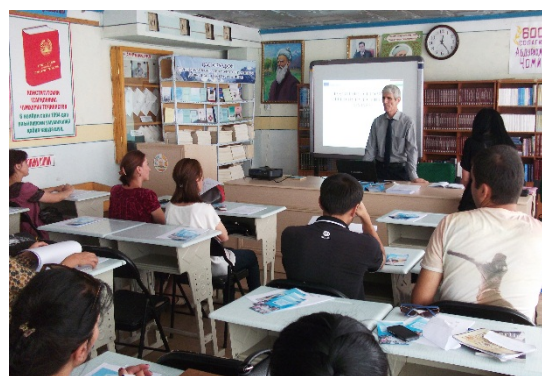
Information seminar, 29 August 2016, Khorog State University

publication of articles in various national and university newspapers, the organization of round tables and seminars, and by taking part in various international projects. The seminars are aimed at promoting the best practices of European and Central Asian universities, e.g. on topics such as quality assurance in higher education and developing qualification frameworks. Some HEREs have initiated Erasmus+ projects, including bilateral mobility projects with European universities, which allow staff members to improve their skills in relation to building competences of students, developing learning outcomes etc. Furthermore, the HERE team provided support to the national authorities through their expertise and gained experience from the HERE seminars, by prioritizing the objectives and contributing to the development of proposals in the framework of the World Bank Higher Education Support Program.