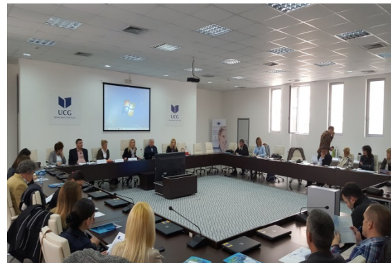
HERE seminar (TAM) on modularization of curriculum, 26 April 2016, University of Montenegro

3. HERE Seminar "Internationalization of Higher Education", raised awareness on various aspects of internationalization, not always perceived by the academic community and especially important for small countries and small education systems. The University of Montenegro is now planning an internationalization strategy.