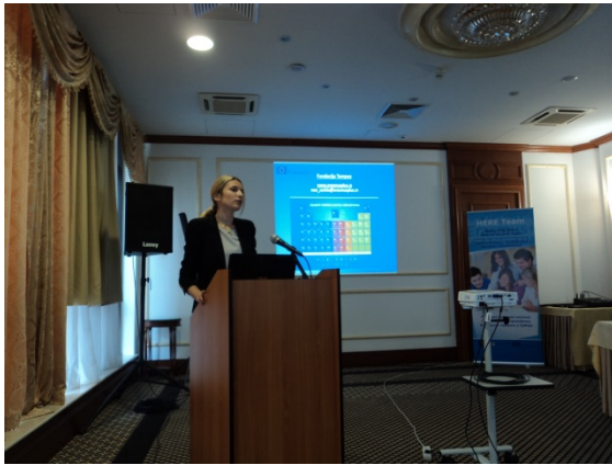
Expert meeting: "Strengthening the capacity of study programmes in the field of environmental protection", 24 November 2016, Arandjelovac

In November 2016, an expert meeting "Strengthening the capacity of study programs in the field of environmental protection" was held in Arandjelovac. The event was a good opportunity to provide insight into the structure, content, defined goals and outcomes of study programmes in the field of environmental protection in the Serbian system of higher education on the one hand, and the real needs of the economy on the other. Representatives of the industry were also invited and took an active part in the event.