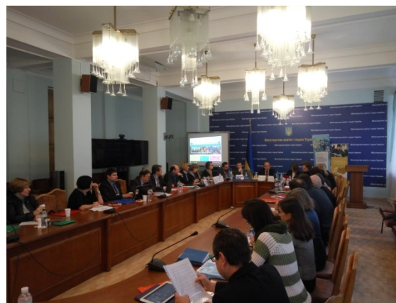
Cluster Seminar for Tempus and Erasmus+ Structural Projects, 17 November 2016, Ministry of Education and Science of Ukraine

The expert team also worked in constant consultation with the representatives of the Ministry of Education and Sciences of Ukraine and the National Agency for Quality Assurance in Higher Education regarding issues related to the development of the Quality Assurance system.