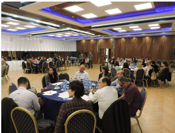
Roundtable "How to boost the participation of Albanian HEIs in Erasmus+", 26 May 2016, Hotel Tirana International"

1. Organization of HERE Round Table on ‘How to boost the participation of Albanian Higher Education Institutions in Erasmus+’. The main goal of this event was to identify the challenges and to propose measures to increase the participation of Albanian Higher Education Institutions in the Erasmus+ programme. One of the most important results was the production of a recommendations’ paper addressed to both policy makers and higher education institutions (including HEI’s Management - Rectors, Deans and Heads of Department, IROs and academic staff). The document was considered important for feeding into the drafting process of the bylaws for the new law “On higher education and scientific research in higher education institutions in the Republic of Albania”.