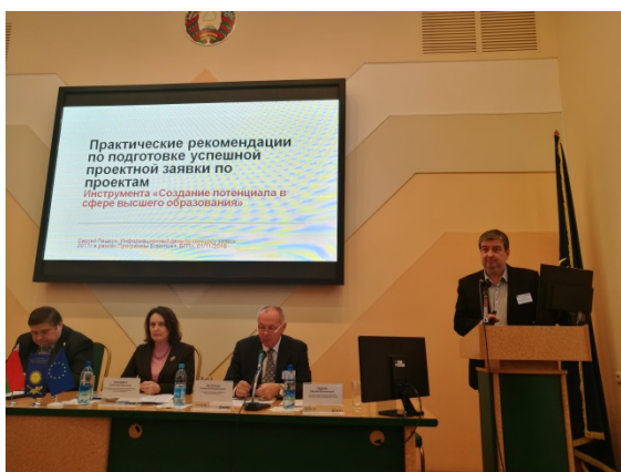
HERE presentation at Erasmus+ information day, 1 November 2016, Belarusian State Pedagogical University named after Maxim Tank

At institutional level , the HEREs provided trainings and organized meetings at HEIs, presenting different aspects of reforming higher education systems, promoting the Erasmus+ programme and EHEA tools, disseminating best practices and international experience gained during their participation in international seminars.