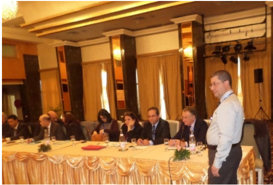
Technical Assistance Mission: Montage d'un Projet de Mobilité des Etudiants, 24 March 2016, Hotel Le Palace Gammarrh

projects, including the national project on which the MESRS is working.