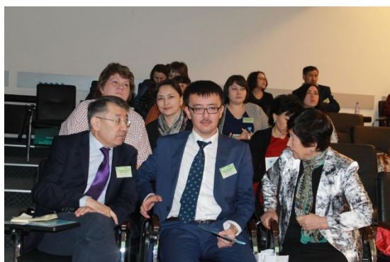
TAM Seminar on International Credit Mobility and ECTS, 14-15 April 2016, Narxoz University

The areas of HEREs' specialisation correspond to the content of the reforms that are being implemented in the country: internationalisation of HE, academic mobility, HE system governance at national level, ECTS, innovations in education, academic policy of universities, e-learning, joint educational programmes, student self-governance, educational process governance, national and sectoral qualification frameworks, professional standards, strategic planning, development of competence based programmes, doctoral programmes, QA, accreditation, and HR policy of universities.