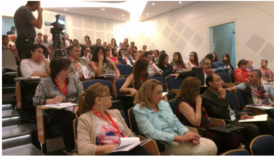
TAM seminar “Indicators for Measuring Performance in Higher Education”, 8 September 2016, American University of Beirut

“Indicators for Measuring Performance in Higher Education” . This TAM seminar organised with the support of SPHERE took place on September 8, 2016 at the American University of Beirut. As a preparation for this seminar, the HERE team produced a reader in 3 languages (EN, FR, AR) in which models and characteristics of systems of indicators were described. The document also showed the needs and challenges related to the usage of indicators within the Lebanese higher education system.