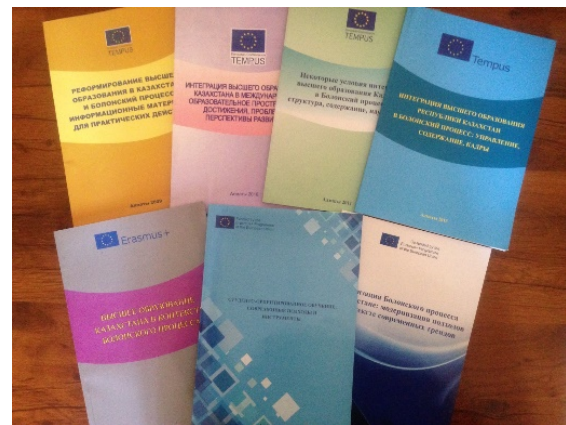
7 HERE publications since 2009