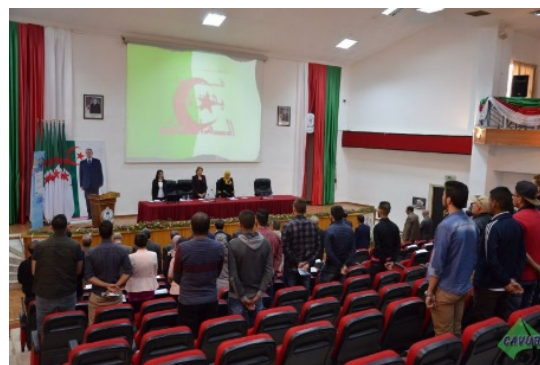
Erasmus+ Info Day in Batna, 3 November 2016

The participants attending the dissemination events were rectors, vice-rectors, academics, heads of laboratories, professors, administrative staff, students, and representatives of local press agencies and radio stations.