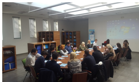
HERE seminar (TAM) on internationalization of HE, 8 December 2016, University of Montenegro

The HERE team in Montenegro is composed of people having considerable experience in managing training, research and strategic issues. By deciding an annual framework programme at the beginning of the year, the HERE Team defines priority topics in line with the overall national strategic approach. The topics that were defined as the topics of interest for the wider academic public included: mobility and internationalization, fostering the capacities for recognition, and fostering capacities in doctoral studies. By organizing events and disseminating information, the HEREs also generated an overall positive opinion towards internationalization.