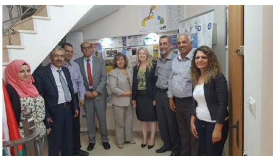
Palestinian HERE team

The Palestinian HERE team is composed of eight members; two women and six men. The team is geographically distributed over all areas in Palestine from north to south. The team members represent university rectors & deputies, the Ministry of HE, the Accreditation and Quality Assurance Commission (AQAC) and academics.