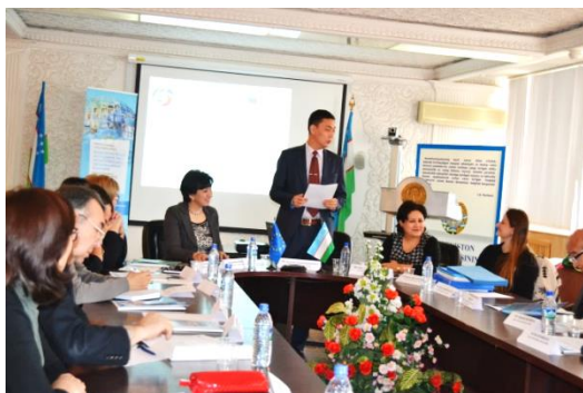
TAM on "Best practices of English teaching methodology for non-linguistic educational programmes and teachers", 14-15 January 2016, Tashkent State Institute of Oriental Studies

The national HERE team of Uzbekistan consists of 11 members, who represent different higher education institutions and regions of the country. The team includes two representatives of the Ministry of Higher and Secondary Specialised Education (MHSSE), a doctoral student, and the other members are mainly HEIs' staff of different levels and backgrounds (e.g. finance, politics, engineering, medicine, philology and journalism). The team membership is periodically updated, mainly due to team members' changing work positions. For instance, in 2016, three members left the team for this reason, and a representative of the Cabinet of Ministers (who is in charge of education) was included into the team.