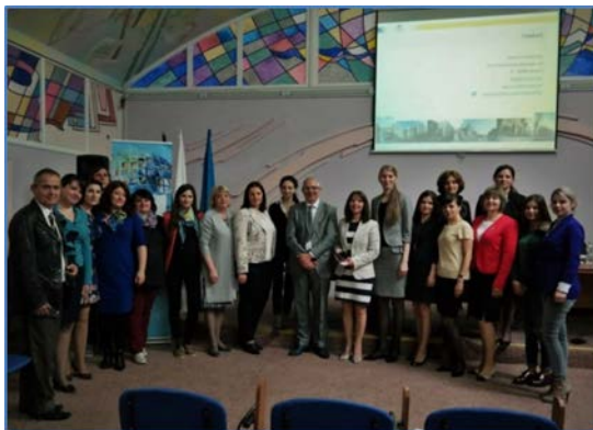
TAM on "Internationalisation in Higher Education. Role of International Relations Offices in the Moldovan HEIs - support or leadership?", 25 April 2016, Free International University of Moldova

2. On the basis of the successful experience, the Moldovan HERE team continued with the second edition of the annual HEREs publication "Current trends in higher education in the Republic of Moldova". This publication has been distributed during the NEO events organised in Moldova and allows to ensure a better visibility of HERE activities.