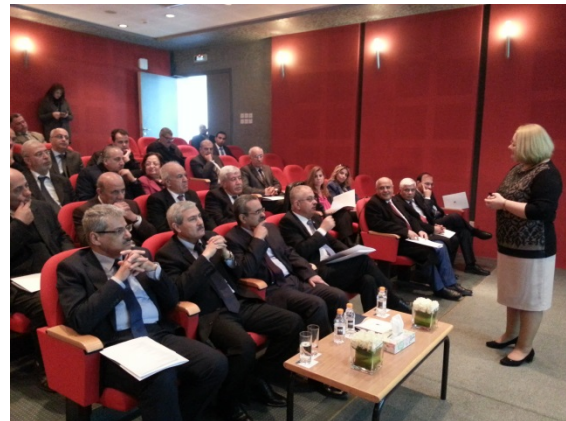
Technical Assistance Mission "Leadership Management Benchmarking for Quality Leadership in Jordanian Universities", 15 March 2016, Princess Sumaya University for Technology

The team of Higher Education Reform Experts is quite involved in the higher education reform process in Jordan. Most of the presentations delivered by members of the HERE team in 2016 were in areas of relevance to the main themes of reform. Moreover, Jordan hosted in 2016 three Technical Assistance Missions (TAMs), and they were all related to the reform process. As a matter of fact, the Ministry of Higher Education and Scientific Research hosted two of these TAMs.