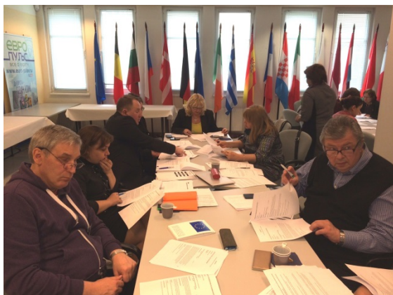
TAM training "Development of competence-based PhD and Master Programmes", 23-24 March 2016, EU Delegation to Russia

The HERE team comprises 15 members, five men and ten women (which reflects the overall gender situation in Russian higher education). The experts' profiles include one rector, four vice-rectors for international relations, three vice-rectors for quality assurance/research, five heads/directors of International relations units/international projects departments/units/centres, one head of academic mobility office and one department head. They represent the geographic diversity of HE institutions in the country (covering most Federal Regions, namely the Central, North-Western, Siberian, Urals, Southern and Volga Federal Regions). The HEREs work at leading universities in their regions, their institutions having an established reputation and traditions that are recognized by their peers, not only regionally but also on the national level.