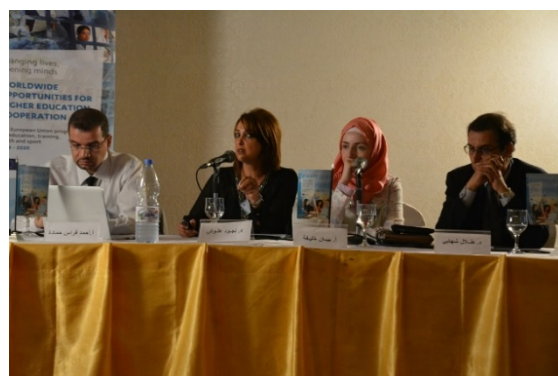
HERE team members at the national Erasmus+ Information Day, 14 August 2016, Orient Club Damascus

3. The active participation of the HERE team in the NEO national information days. They presented the experiences they gained from the international HERE events to local Syrian academics and HE students. The national Erasmus+ information day took place on 14 August 2016.