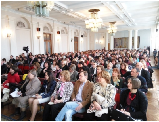
HERE Seminar for Higher Education and Research Institutions on PhD Programme implementation, 4 April 2016, Ministry of Education and Science of Ukraine

1. The experts actively participated in the development of the draft Law of Ukraine "On Education", which passed first reading in the Parliament in 2016. They also provided expertise of 47 drafts of the Higher Education Standards.