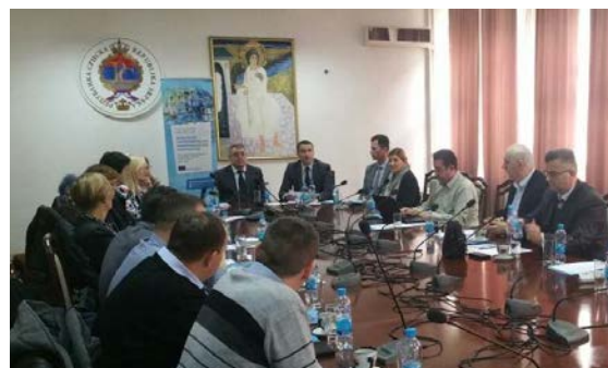
HERE annual dissemination workshop, 7 December 2016, University of East Sarajevo

The local HERE events organized in BiH in 2016 supported the above mentioned reforms through the organization of 2 annual HERE conferences and 3 Technical Assistance Missions (TAMs), focusing on themes such as short cycles in the qualifications framework, multidisciplinary PhD programmes, and the development of qualification standards and occupational standards. These events gathered more than 150 participants, including representatives of ministries, higher education institutions and other relevant stakeholders.