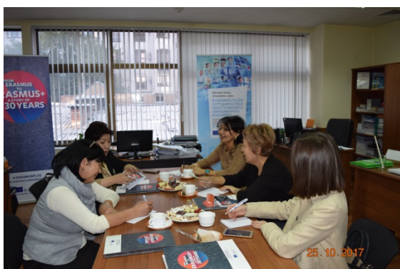
Meeting of the Kyrgyz HERE team

The composition of the team reflects various aspects of the on-going higher education reform process in the Kyrgyz Republic, and duties and responsibilities in the team are distributed accordingly. The experts are also members of working groups dealing with policy advice: the Public Expert Council for Education and Science under the President of Kyrgyz Republic, and the working groups of the Ministry of Education and Science. This allows the experts to actively participate in the development of strategic, regulatory and methodological documents aimed at creating a competitive national higher education system.