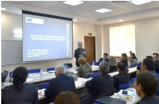
TAM on “Perspectives of E-learning and ICT based education: applicability of best practices in Uzbek Higher Education Institutions”, 11-12 November 2016, Uzbekistan State University of World Languages