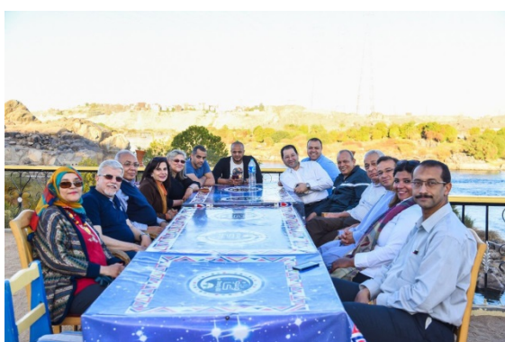
Members of the Egyptian HERE team

The composition of the Egyptian HERE team takes into consideration geographical distribution (current members of the HERE team are from universities covering most of the geographical regions in Egypt), gender (five out of 15 members are women) age groups (senior and Junior members), and profile (presidents/Vice Presidents of Universities, Professors, and Teaching Staff, as well as a member from the National Agency of Quality Assurance).