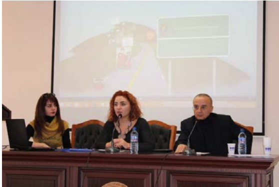
Seminar "Higher Education development pathways in the frames of employment, research and innovation", 22 December 2016, Armenian State Pedagogical University

The members of the team made use of the tools provided by their mandate, such as the organisation of Technical Assistance Missions (TAMs), dissemination seminars and workshops, trying to find practical ways to impact on the specific areas.