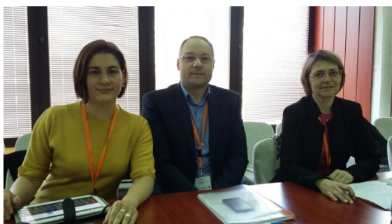
Meeting of the Belarussian HERE team

During 2016 the Belarus national HERE team was composed of 10 experts. The team was chaired by the Head of the Higher Education Department of the Ministry of Education. Seven experts represent HEIs located in Minsk and two represent HEIs in the regions. The majority of experts represent state universities. All experts, except the student representative, hold positions of chiefs/heads of departments or vice rectors, which makes possible for them to have access to different stakeholders in higher education (academic staff, students, Ministry of Education, relevant international organizations) in their HERE capacity.