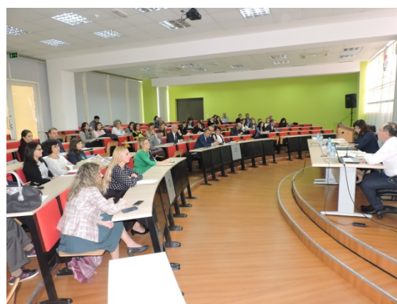
Seminar on Albanian Qualifications Framework, 7 November 2016, University of Tirana

The main HERE contributions to the new law consisted of the proposal for a Higher Education Quality Code updated pursuant to the European standards and quality guidelines, the improvement of HEI's governance mechanisms conditioned only to the performance, the improvement of management quality and accountability, and the allocation of funds based on quality indicators for teaching, research, innovation, creative activities and development. Moreover, fully in line with HERE recommendations, the new law guarantees financial autonomy by granting the HEIs the right to generate legitimate incomes from teaching activities, scientific research activities and by other economic income, as well as the right to seek private funding and to receive loans for their institutional and infrastructure development. Last but not least, the same law grants to higher education institutions the right to define internal rules of funding distribution, and to administer real estates and other legal possessions.