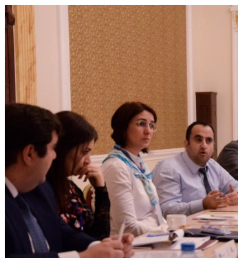
HERE presentation at the event "Erasmus+ perspectives for HEIs and international cooperation", 10 March 2016, Khazar University

The Ministry of Education is actively collaborating with the HERE team. For instance, the recent Twinning project at the Ministry of Education under the title: "Support to the Ministry of Education of the Republic of Azerbaijan for further adherence of the higher education system to the European Higher Education Area" has included all HERE team members into their activities such as workshops, roundtable discussions and trainings. The experts were able to share their experience and contribute to the Ministry of Education initiative to promote HE reforms in the country.