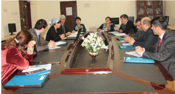
TAM Seminar on "Quality Assurance in Higher Education", 22 January 2016, Dushanbe Branch Moscow State University

learning outcomes. The training covered aspects related to designing study programs based on learning outcomes and presented EU experience in the development of national and sectoral qualifications frameworks.