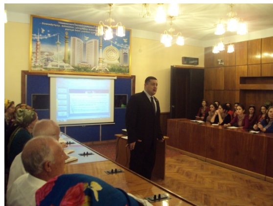
Presentation "Learning outcomes and student-centred learning", 2 May 2016, Turkmen National Institute of World Languages named after Azadi

In 2016, the Turkmen HERE Team organized training events in the form of presentations and workshops on topics such as the impact of the Bologna process on reforms of HEIs, student-centred learning, and innovation technologies in higher education.