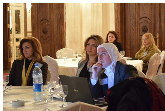
Participants of annual HERE event, 28 December 2016, Orient Club Damascus

1. The annual HERE team's event in Syria for HE reform policy about "Applications and Mapping of the Analytical Framework for HE Reform Policy and Development", which took place on 28 December 2016, as a follow up event of the HERE Annual Conference in Barcelona (December 2016). This local HERE event was the first of its kind in Syria. It was organised by the HERE team and the Syrian NEO, to present to Syrian HEIs the Analytical Framework Matrix for HE reform policy and to map this matrix to Syrian HEIs.