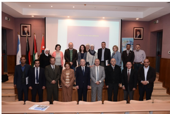
HERE seminar, "National Qualifications Framework, the Diploma Supplement and Degree Profile", 20 November 2016, German-Jordanian University

1. During 2016, the HERE team conducted 19 seminars and workshops, covering universities located all around Jordan. These activities focused on several higher education reform aspects. Seminars about Learning Outcomes and Graduate Attributes, the National Qualifications Framework, the Diploma Supplement and the Degree Profile were delivered by the HERE Chairman at 10 public and private universities. Another seminar on "Modernization of Institutional Management of Internationalization" was delivered by another HERE at 5 universities. One workshop was conducted at the University of Jordan by one of the HEREs on "New Trends in Teaching Methods at University Level". This workshop provided some best practices from European universities regarding the methods related to student-centred learning. Furthermore, it highlighted the linkage between learning outcomes, teaching methods, and assessment at university level. Two seminars on the "Role of Social Media in Higher Education" were delivered jointly by one HERE and the only student HERE. These seminars aimed to make both faculties and students aware about the importance of the social network use in their classes in the teaching and learning process. The above seminars and workshops were attended by many staff