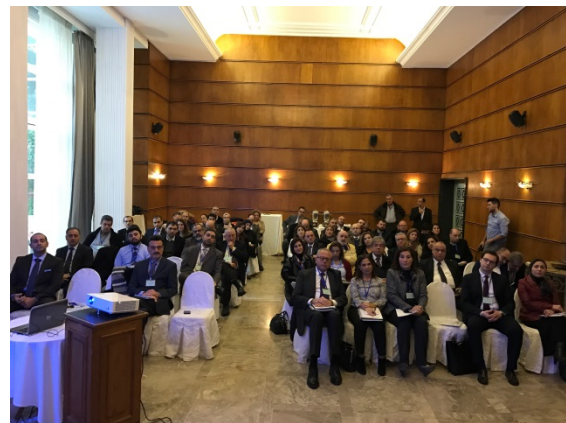
Roundtable on “Financing Higher Education”, 2 December 2016, Arab Open University,

remaining private HEIs (about 46) depend to a large extent on the tuition fees, that differ largely from one institution to another. In addition, limited funds are available to support research. Moreover, the number of HEIs is increasing while the number of students stopped to increase since 2013 (employability is suspected to be the reason). This increases the financial pressure on the institutions. The study results suggest that the HE system must seek higher quality and must define ways to share resources. All the findings were summarised in a reader (English and French). This event was jointly organised with the Arab Open University. The EU expert Pedro Texeira presented to the participants the different financial models. He stressed on financing efficiency and effectiveness especially with the limited available resources. He also covered issues related to competitiveness and diversification. Recommendations were debated.