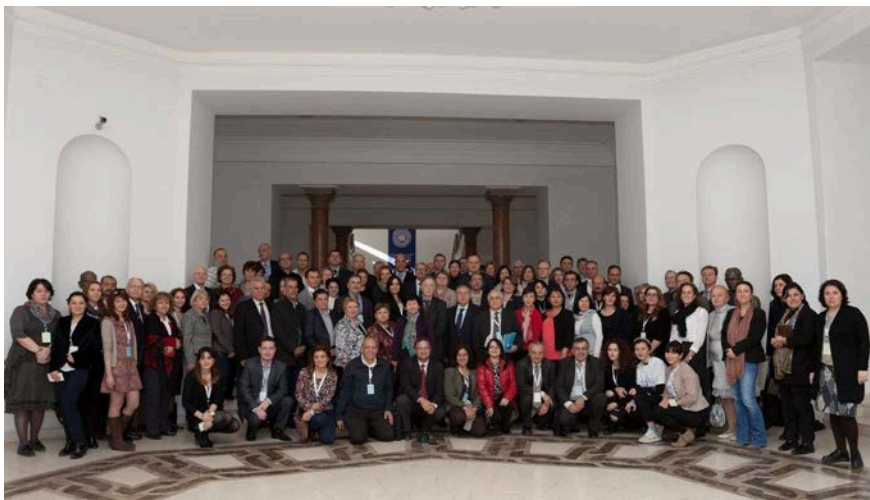
Participants of the 2015 annual HERE conference in Georgia (December 2015)

More than 100 participants from 25 Partner Countries attended the event, including 64 HEREs and 25 NEO representatives. The programme focused on three main topics: 1) student centred learning, 2) the role of ICT in teaching and learning and 3) curriculum design in the context of innovative teaching and learning.