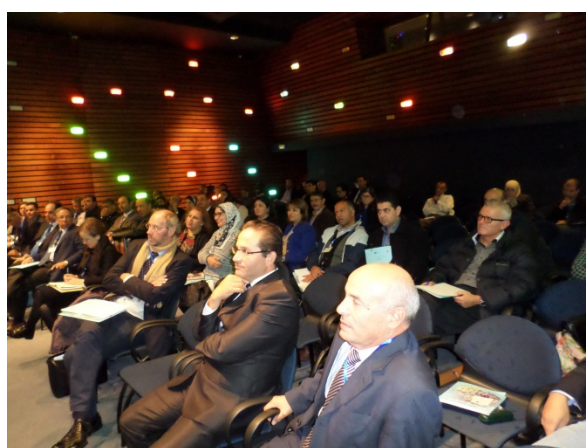
Participants of local HERE seminar in Tunisia (November 2015)

Typically, most local activities consisted of follow-up events of the international training seminars and of events facilitated by the so called "Technical Assistance Missions" (see section 4.2 below). The scope of activities varied, but most of the events gathered between 50 and 100 participants, while some of the larger events reached several hundreds of participants.