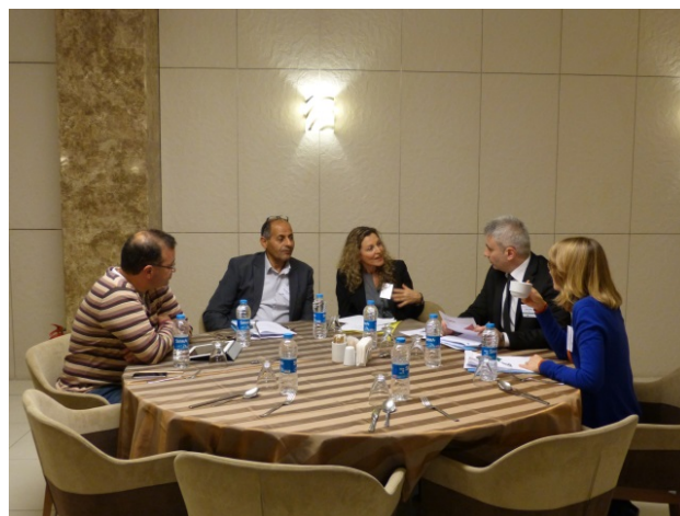
Preparatory meeting at the Istanbul HERE conference (March 2015)

The aim of the conference was to discuss current trends and challenges in linking higher education and vocational education and training (VET). In particular, the objective was also to explore partnership options between the two sectors to support VET and socio-economic development.