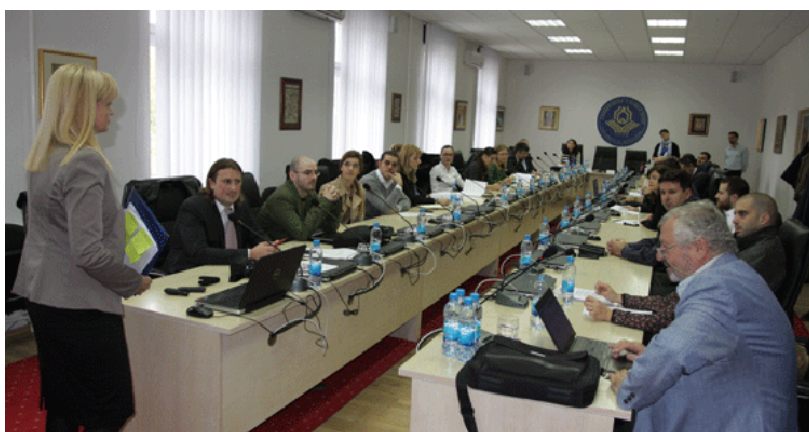
TAM workshop in Bosnia and Herzegovina (October 2015)

Overall, the 2015 TAMs reached a total audience of 1.754 participants, with an average size of 63 participants per event. The duration was usually of one or two days, and the type of events ranged from small working groups to conferences with more than 100 participants.