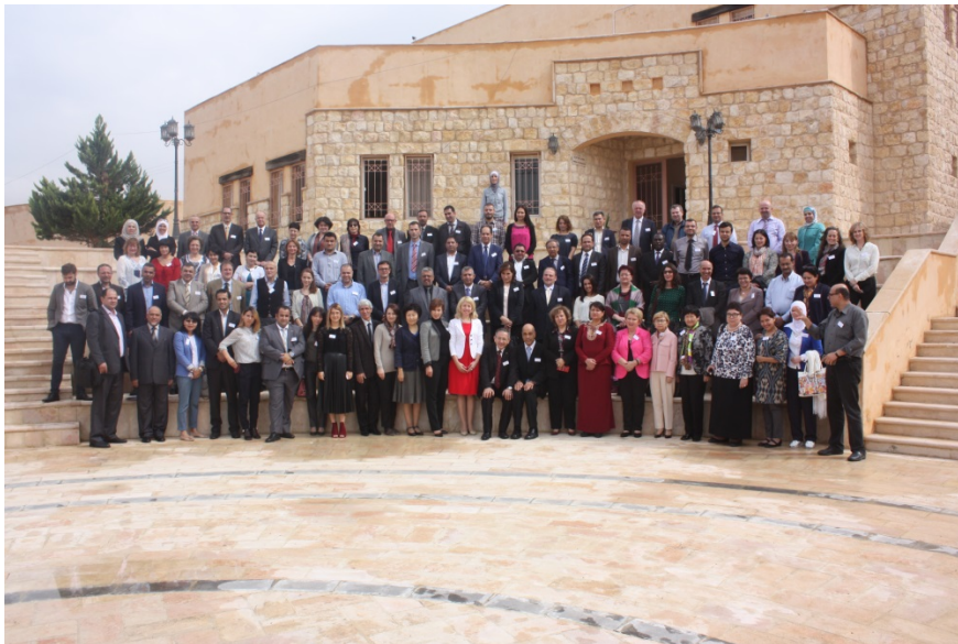
Participants of the seminar on ICT based learning in Jordan (October 2015)

One of the top priorities expressed by HEREs and NEOs in the Needs Assessment exercise carried out in early 2015 was to explore new developments in e-learning. In many of the Partner Countries, higher education institutions and policy makers are looking for ways to better harness the opportunities offered by ICT, blended learning and online course delivery, while taking into account the implication for access to and innovation of teaching and learning.