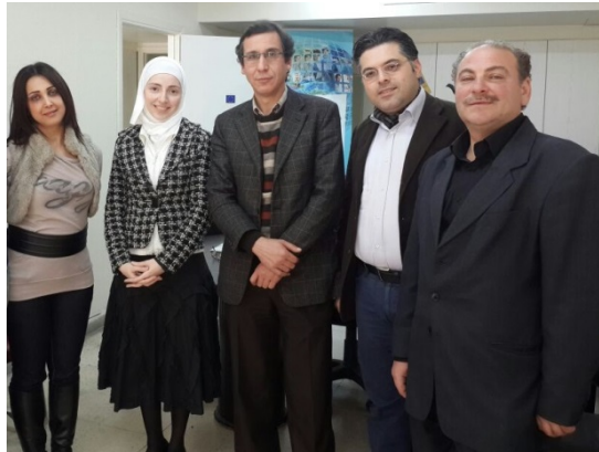
Members of the Syrian HERE team and NEO coordinator at their first meeting in 2015

The possibility to allocate financial compensations for activities performed by HEREs was introduced in the 2015 NEO Grant Agreements. This mechanism enables NEOs to reward individual HEREs for specific activities that require a particular effort and investment in time and that lead to a concrete input (e.g. writing an article or publication, organising an event, etc.). It should be noted that this possibility was not fully used by all NEOs in 2015, probably due to the novelty of the scheme and to uncertainties as to how to use it correctly and for which type of tasks.